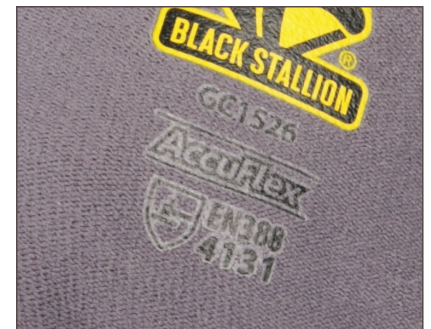
Tested to EN388 4131 – level 4 Abrasion resistance; level 3 Tear resistance