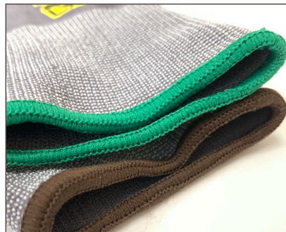
Color-Coded Binding for quick & easy size identification