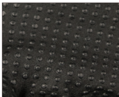
Micro-Dot Palm System offers excellent oily, wet, & dry grip